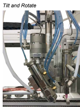
Tilt and Rotate