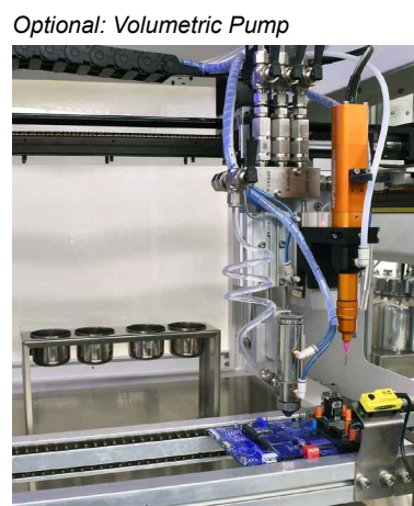
Optional: Volumetric Pump