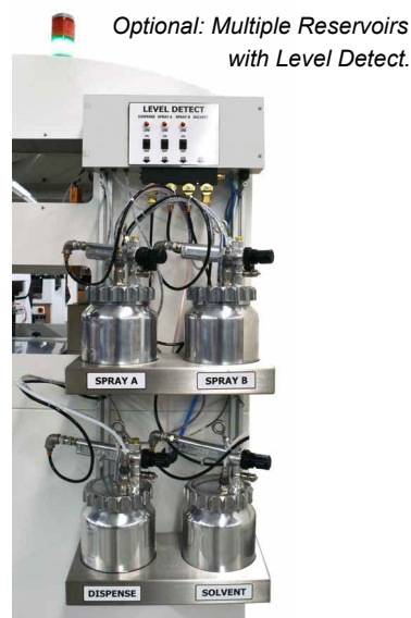
Optional: Multiple Reservoirs with Level Detect.